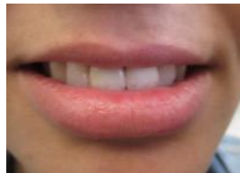
Fig. 6. The tooth shade is in harmony with the surrounding dentition