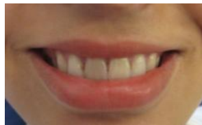
Fig. 2. Extra oral view showing the impaired aesthetic aspect

When they were exposed to vitality testing, central incisors did not show any signs of