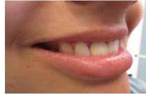
Fig. 7. Final result showing an improvement of the smile

fact devitalized teeth have smaller resistance and high fracture risk [25]. Reeh et al. [22,38] demonstrated, also, that cavity preparation and endodontic treatment are associated with a loss of structure and accordingly a loss of strength. This fact was, also, confirmed by other studies which proved that endodontic procedures were responsible for 38% of reduction of flexural strength of the crown [22].