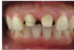
Fig. 4. Tooth preparation: Dark abutment teeth