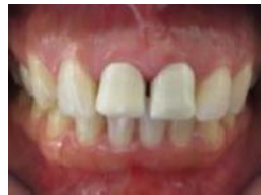
Fig. 5. Zirconia cores