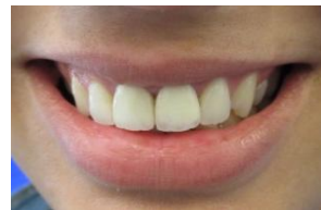
Fig. 8. Front view of final restoration

Many authors describe teeth devitalization as a consequence of a routine orthodontic treatment. In fact and according to studies pulp necrosis can occur in 5% in patients having the history of orthodontic treatment during adolescence [6].