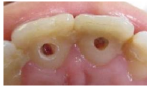
Fig. 3. Intra oral view showing access cavities

and glazing .This allows verification of the crown morphology and color. So, both of them can be modified in this stage. Aspects such as contact points and occlusion were, also, assessed and adjusted. After the removal of temporary restoration, the abutment teeth were cleaned with chlorhexidine and the final restorations were cemented using Zinc phosphate cement. The tooth shade was in harmony with the surrounding dentition. The patient was fully satisfied with the aesthetically pleasing outcome [Fig. 6, Fig. 7 and Fig.8]