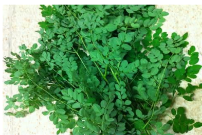
Fig. 1a. Fresh Moringa oleifera leaves

support sustainable land practice use [6]. Researchers at the Asian Vegetable Research and Development Center [7] reported that leaves from four (4) different moringa species ( Moringa oleifera , Moringa peregrina , Moringa stenopetala and Moringa drouhardii ) contained high levels of nutrients, vitamins and antioxidants [6]. Bureau of plant industry reported MO as an outstanding source of nutrients among the Moringa species. Its leaves (weight per weight) have the calcium equivalent of four times that of milk, the vitamin C content is seven times that of oranges, while its potassium is three times that of bananas, three times the iron of spinach, four times the amount of vitamin A in carrots, and two times the protein in milk [8]. The nutritional and medicinal properties of MOL suggest it as a good option for the replacement [9-12,4,13]; hence this study investigated the nutritional composition of Moringa oleifera leaves and the effect of its bio-fortification with animal feed on physical changes and organ weight.