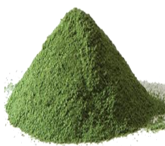
Fig. 1b. Moringa oleifera leaves powder