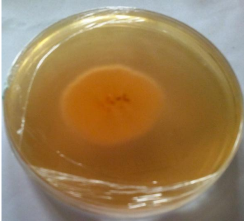
Fig. 4. Yellowish reverse colony of T. mentagrophytes on SDA