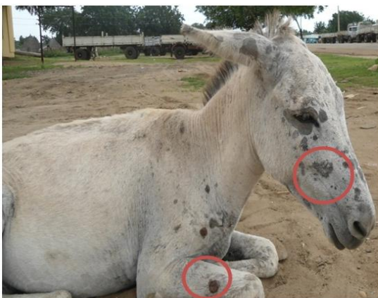
Fig. 1. Localized skin lesions of dermatophytes on the face, neck and fore limbs

Infected animals showed skin lesions started as alopecia, severe incrustation, scaling, on the flanks backs, face, ears legs and gluteal areas similar to dermatophyte lesion. Other lesions of ringworm were observed on the withers and saddle area, but the infection was spread to the neck, chest and head with one or more legs being involved (Figs. 1 and 2).