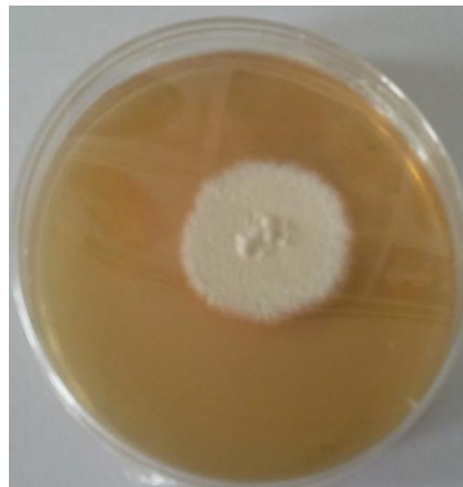
Fig. 3. White to creamy powdery colony of T. mentagrophytes on SDA

On potato dextrose agar and corn meal agar creamy colonies with granular surface on obverse and pale grey on reverse were obtained. On blood agar, as from days 5 a clear zone of \beta -haemolysis was observed around the colony.