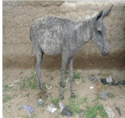
Fig. 2. Generalized skin lesions of dermatophytes

Two different isolated colonies were obtained on SDA, macroscopic feature of the isolated fungi for isolate 1 showed moderate rapid growth of a white to creamy flat powdery colony (Fig. 3). At 7 days on incubation, nodular granular white to creamy colony on obverse and a pale yellowish on reverse was observed (Fig. 4).