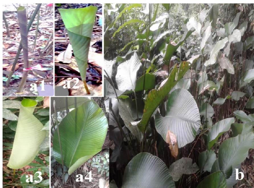
Fig. 2. Horn stages and population structure

environments. Variation in population density leads to a variation in leaf production. The gross leaf production of Megaphrynium macrostachyum was estimated to be about 148,646 \pm 66,623 leaves, i.e. an average of 11 \pm 3 leaves per tuft. Of this total gross production, about \frac{3}{4} will be exploitable, i.e. on average 104,167 \pm 45,271 exploitable leaves of Megaphrynium macrostachyum per hectare; this corresponds to about 7 \pm 6 exploitable leaves per tuft. The number of harvestable leaves was found to be highly variable between tufts, indicating an uneven distribution of useful production within a stand.