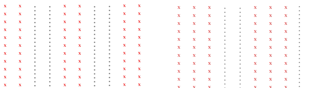
Fig. 2. Sweet corn-based vegetable legume intercropping system in 2:2 row proportion