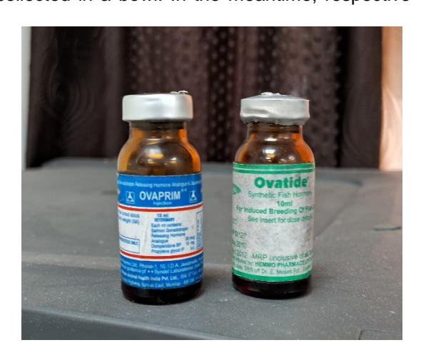
Plate 1. Synthetic hormones

At first female was stripped and eggs were collected in a bowl. In the meantime, respective