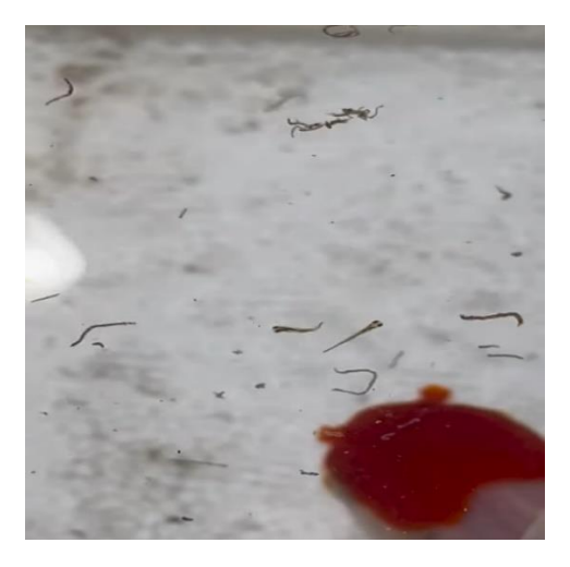
Plate 5. Goldfish fry