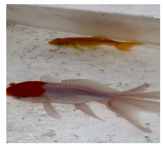
Plate 4. Male and female brooders after hormone injection

dose of ovaprim to induce C. auratus in captivity is 0.7 ml/kg body weight for males and 1.4 ml/kg body weight for females. El-Hawarry et al. [10] reported similar results in silver carp produced with several analogues of dopamine antagonists. The current study demonstrates that, in comparison to control, hormone induction enhances fertilisation, and hatching rate. It was discovered that the treatments differed in terms of fecundity, fertilisation, and hatching rate.