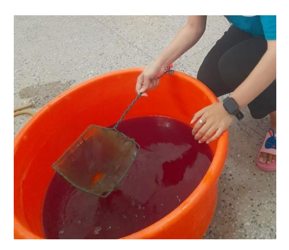
Plate 2. Disinfectant treatment using KmNO<sub>4</sub>