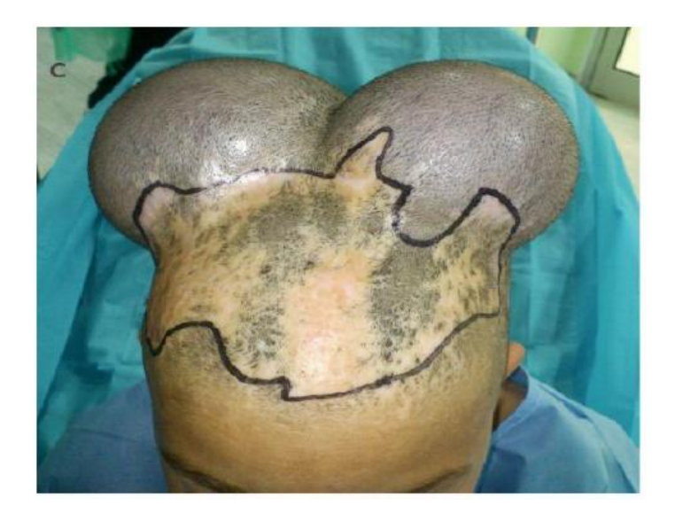
Fig. 2. C. Two expanders in place prior to the second stage of the procedure, the cicatricial area is outlined