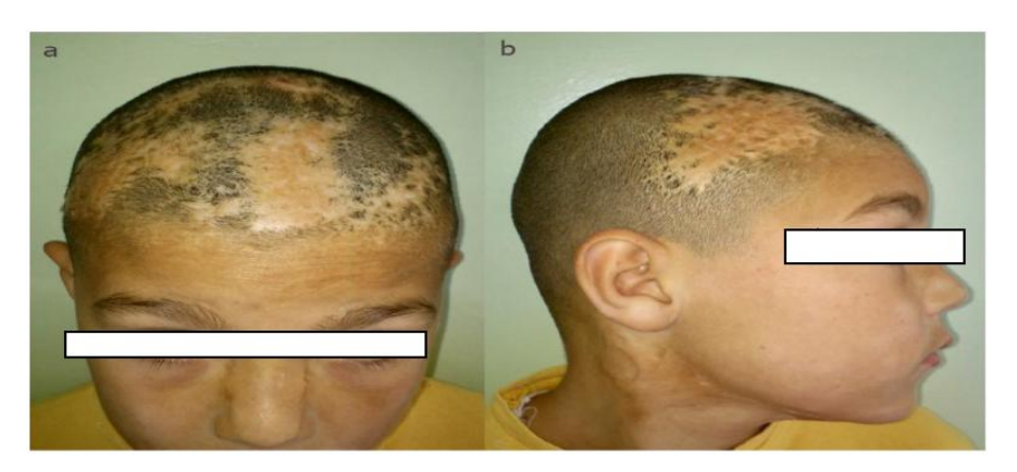
Fig. 2. a, b. Patchy alopecic scar of the frontal, parietal and right temporal area

internal valve. The expanders are overinflated serially to 350 mL and 200 mL, respectively. The right internal valve failed during the inflation period and was substituted with an external one under local Finally, anesthetic. а rotationaladvancement flap is used to reconstruct the defect after scar excision in the second stage of the procedure.