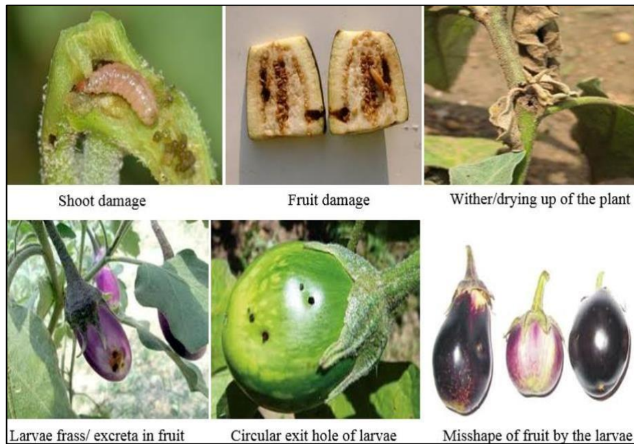
Fig. 2. Nature of damages caused by brinjal shoot and fruit borer

cultivars, susceptible kinds displayed greater levels of shoot infestation. A thin stem, numerous branches, the length and width of the lower third of the leaf, more spines, a rough leaf surface area, a thick cuticle heavily lignified, a broad and thick hypodermis, a closely packed vascular bundle, and a small pith area are characteristics of antixenosis that may indicate a lower infestation or, conversely, a higher infestation. Numerous researchers have examined the antixenosis mechanism of various plant characteristics [75-76]. Their findings have shown that the biophysical characteristics of shoot and fruit borer insect populations are reduced, as shown in Table 2.