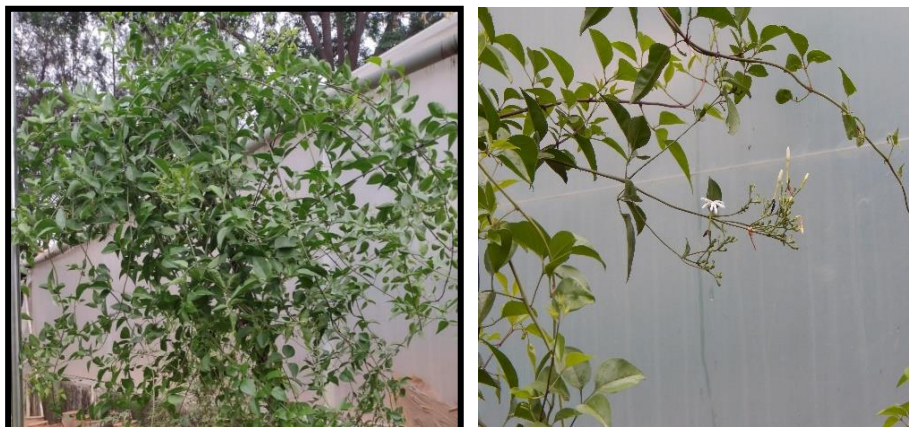
Fig. 1. General view of mysore mallige ( J. azoricum L)