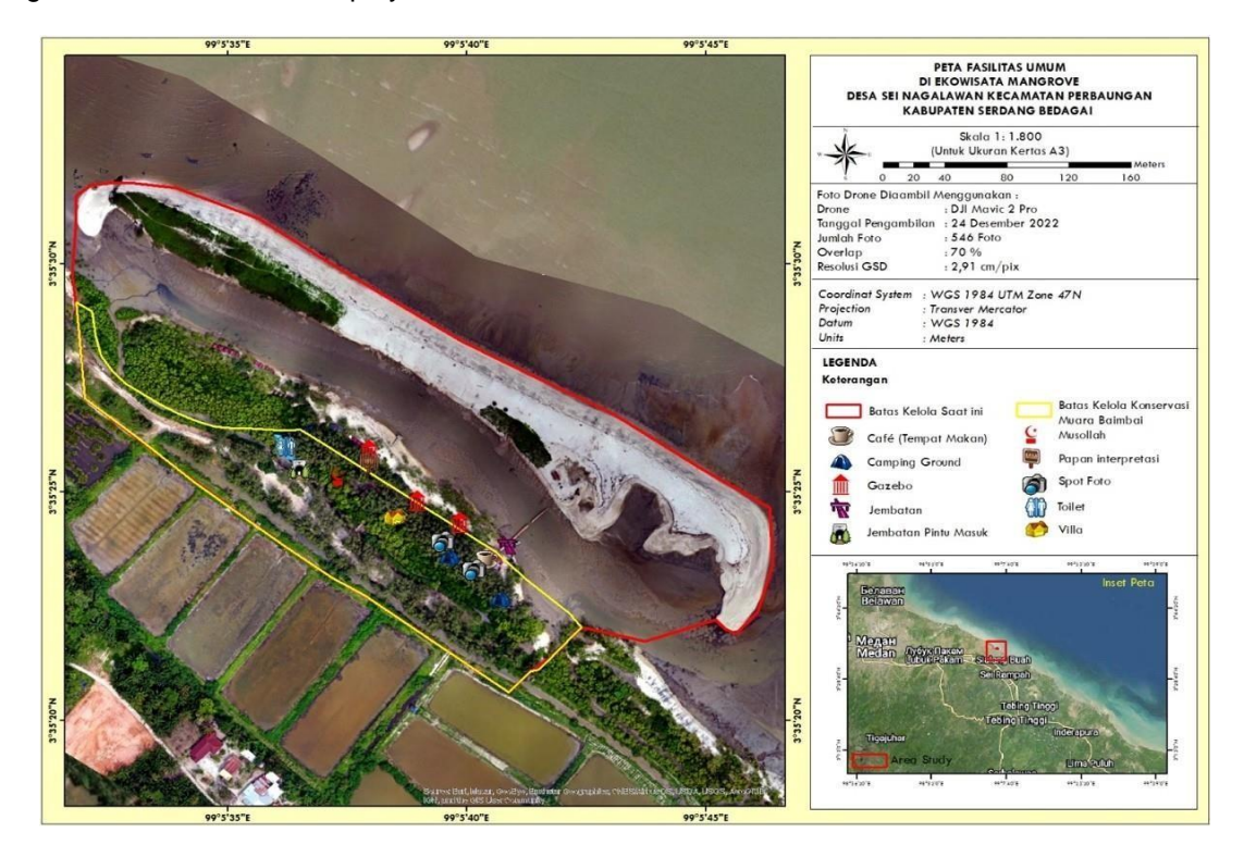
Fig. 2. Boundaries of the permitted area, potential attractions, and ecotourism facilities at Sei Nagalawan Mangrove Beach captured utilizing the DJI Mavic 2 Pro drone

Moreover, the mangrove forest in this location serves not only as a natural attraction but also as an educational object. The mangrove forest has become a learning space for various educational institutions and community groups. The successful rehabilitation of the mangrove forest since 2010 has restored the forest's functions, provided environmental services, and created tourist attractions.