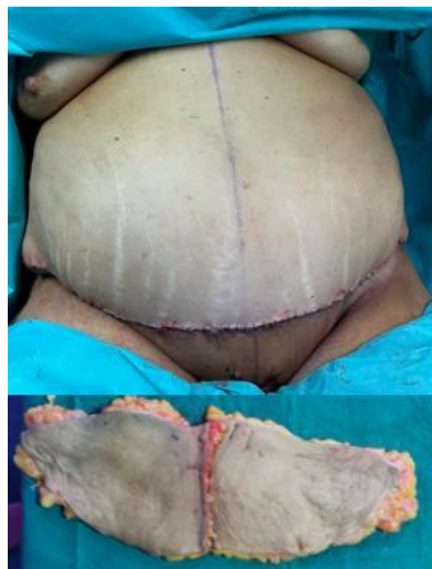
Fig. 7. The skin is closed and excess skin neo-umbilicoplasty will be performed later in this case