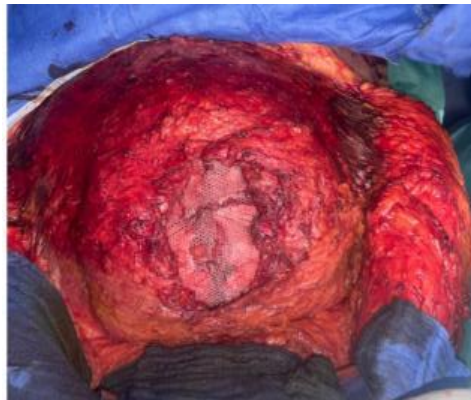
Fig. 4. Polypropylene-coated mesh is placed together over the posterior rectus fascia.