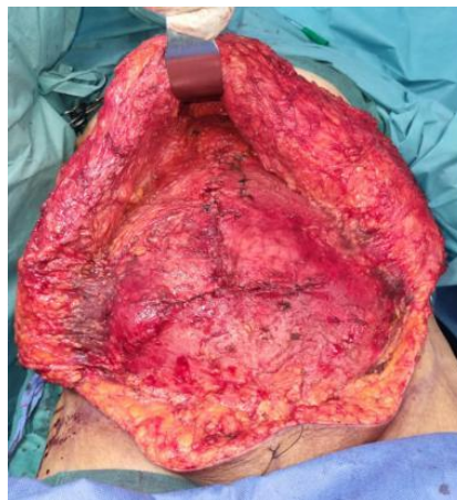
Fig. 6. Dissection extending up to the costal resected a margins and the xiphoid process

The postoperative outcomes were exceptionally favorable, with no recorded complications among any of the patients (Fig. 9). All individuals experienced significant improvements in both functional and cosmetic aspects. In a singular instance, one patient required a planned umbilicoplasty as part of her personalized treatment plan. During the follow-up period spanning 1 to 3 years, there were no reports of complications or hernia recurrences.