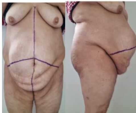
Fig. 1. The drawing of a standard abdominoplasty

The retrorectus spaces are entered bilaterally and extended both superiorly and inferiorly, from the symphysis pubis to the xiphoid. The posterior sheath is closed in the midline with an absorbable running 0 monofilament suture. A lightweight macroporous polypropylene-coated titanium mesh is placed over the posterior rectus fascia (Figs. 4, 5). The abdominal muscles are sutured together. This mesh placement is followed by suturing of the aponeurotic plane.