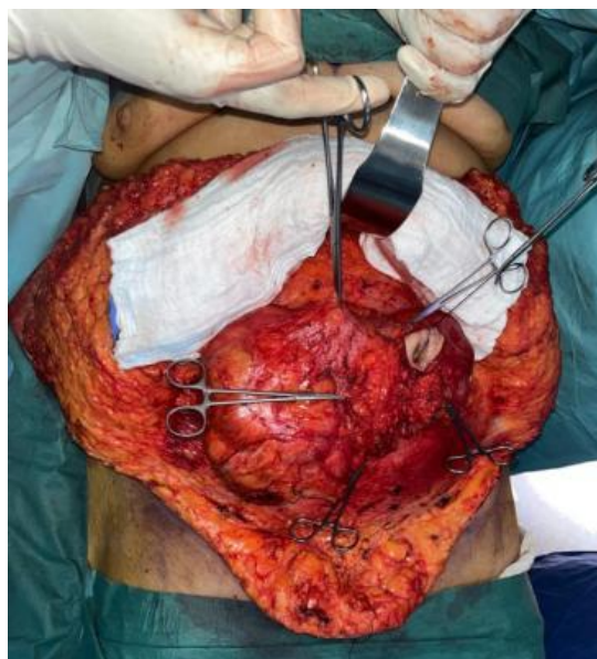
Fig. 2. The sac is liberated, meticulously opened