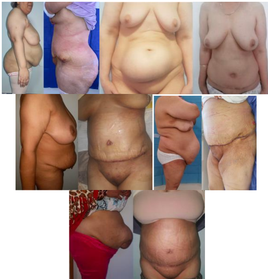
Fig. 9. Photo before and after surgery of the 5 cases