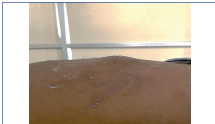
[Table/Fig-1]: Showing anterior abdominal wall swelling.

The patient was planned for incision and drainage and 50 cc of necrotic material was drained [Table/Fig-4].