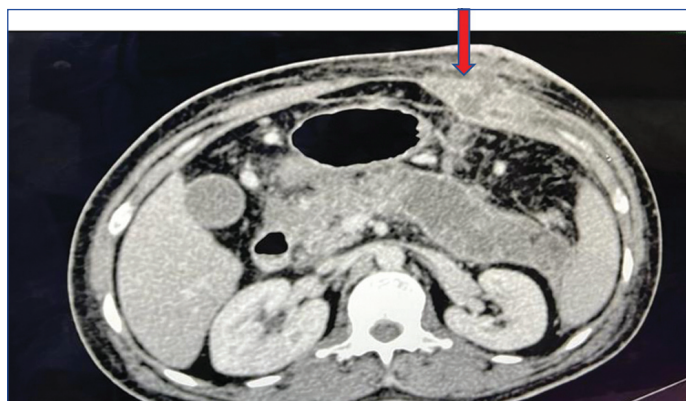
[Table/Fig-3]: CECT abdomen: Peripherally enhancing collection in subcutaneous and intramuscular plane of anterior abdominal wall in left hypochondriac and supra umbilical region if 4.2x2.6x3.9 cm. The collection is communicated with the pancreatic collection through a linear tract passing inferior to greater curvature of stomach and closely abducting the peri gastric collateral vessel.