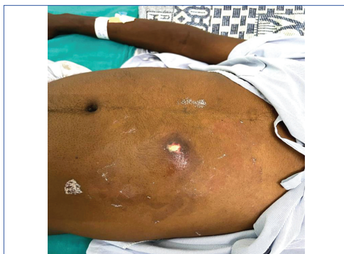
[Table/Fig-2]: Showing pus draining through the swelling.