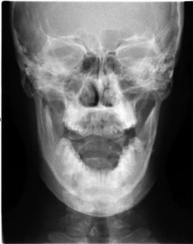
Fig. 5. PA mandible view showing a radiopaque Mass on the left side of ramus region