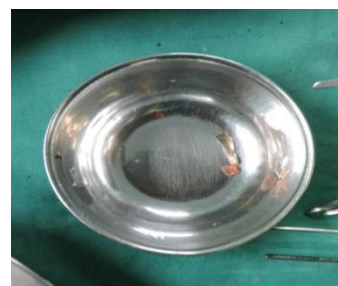
Fig. 4. Two glass pieces were retrieved