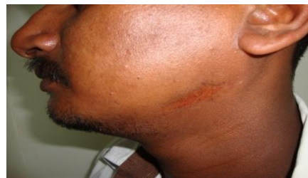
Fig. 2. Profile view showing a scar on the lower left face region