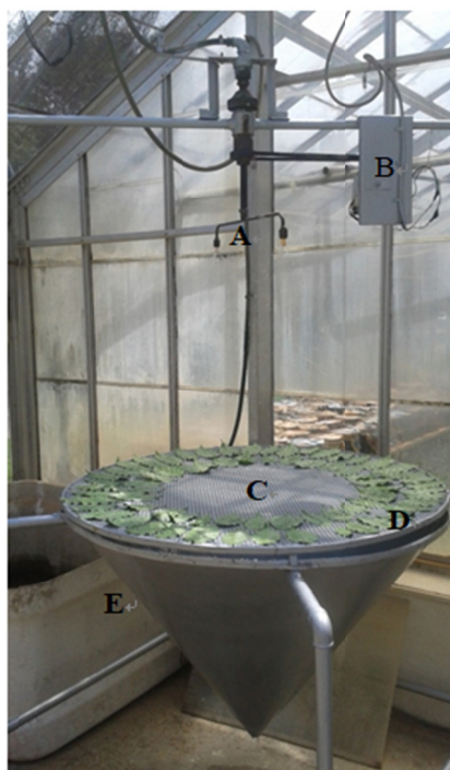
Figure 1. Rainfall simulator used in the experiment. (A) Rainfall simulation nozzles. (B) Nozzle speed control and adjustment. (C) Spray table. (D) Coffee leaves. (E) Water reservoir and pressure control

A rainfall simulator, specially designed to represent all the parameters and configurations of conventional terrestrial equipment was used in this study (Figure 1). This equipment enables the simulating rainfall slides by using special spray tips with flat jet and thick droplets. The equipment was calibrated to provide a rainfall of 30 mm (Silva et al., 2014; Perreira et al., 2017). The application of the pesticides was performed at night (no sunlight) with temperature ranging between 20 °C and 22 °C and 55% of relative humidity. A 30 mm rainfall was artificial after 120 min and 480 min of spraying the chemicals. Leaves sprayed with treatments, and that did not receive simulated rain were used as the control. Some leaves were taken to the laboratory for analysis to determine the copper concentration in the leaf tissue.