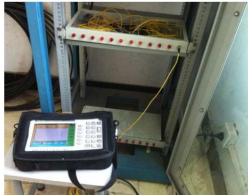
Fig. 3. OTDR connected to fiber under test

Wavelength: 1550 nm Range (km): 2.044 Acq. Time: 10 s Resolution: 16 cm Index: 1.46648000