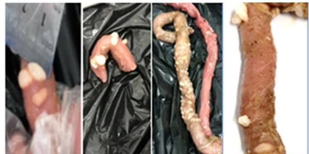
Figure-3: Macroscopic sarcocysts in esophagi of sheep and goats (modified from Swar and Shnawa, 2020)