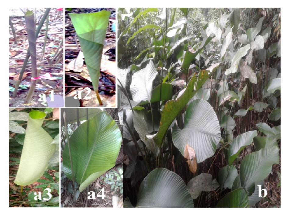
Fig. 2. Horn stages and population structure

environments. Variation in population density leads to a variation in leaf production. The gross production leaf of Megaphrynium macrostachyum was estimated to be about 148,646 ± 66,623 leaves, i.e. an average of 11 ± 3 leaves per tuft. Of this total gross production, about 3/4 will be exploitable, i.e. on average 104,167 ± 45,271 exploitable leaves of Megaphrynium macrostachyum per hectare; this corresponds to about 7 \pm 6 exploitable leaves per tuft. The number of harvestable leaves was found to be highly variable between tufts, indicating an uneven distribution of useful production within a stand.