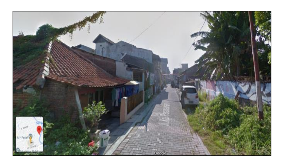
Fig. 3. Peranakan Village Road from west to east

The road pavement on Jalan Kampung Peranakan consists of paving blocks, which support the accessibility needs and long-term durability of the road. The area has a linear morphological layout, with buildings arranged in a row along both sides of the street, creating a spatial pattern directly connected to the daily activities of the local community. With a road width of 3.5 meters, the street provides limited space for vehicles and pedestrians, indicating a semi-private character. The road functions as a shared public facility among the residents, fostering social interaction in a constrained public space.