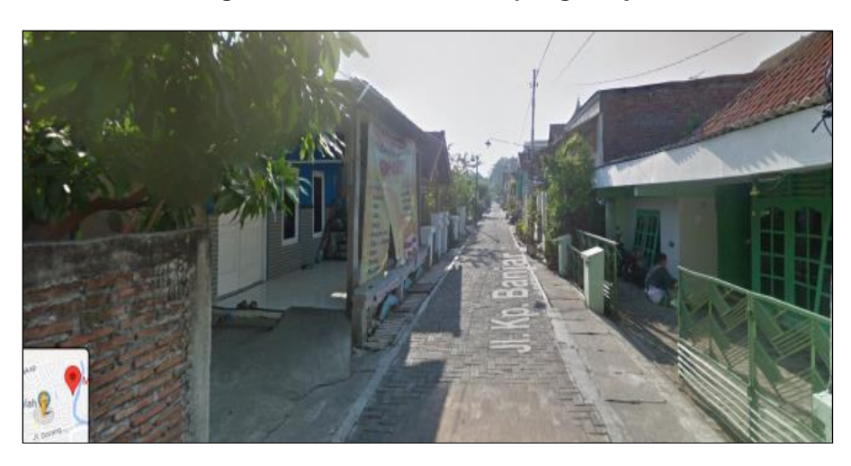
Fig. 5. Banjar Village Road from west to east