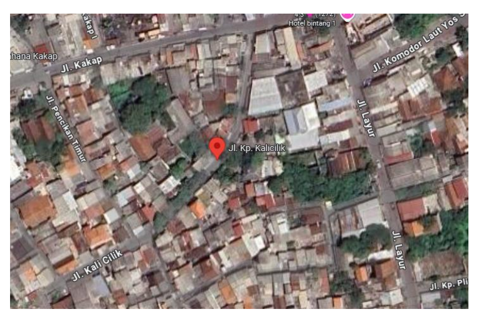
Fig. 7. Street Sketch in Kampung Kalicilik

The condition of residential buildings on Jalan Kampung Kalicilik is quite varied, with some structures being well-maintained while others are in a state of disrepair. This disparity in maintenance may reflect differences in the economic circumstances or priorities of the property owners. Compared to Jalan Kampung Peranakan and Kampung Banjar, the density of buildings on Jalan Kampung Kalicilik is higher,