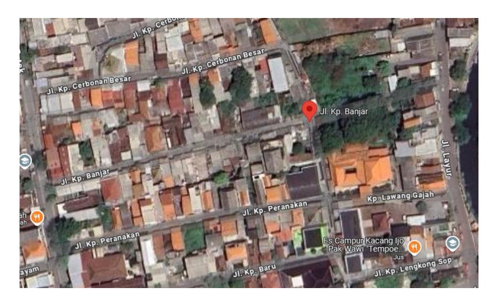
Fig. 4. Street Sketch in Kampung Banjar