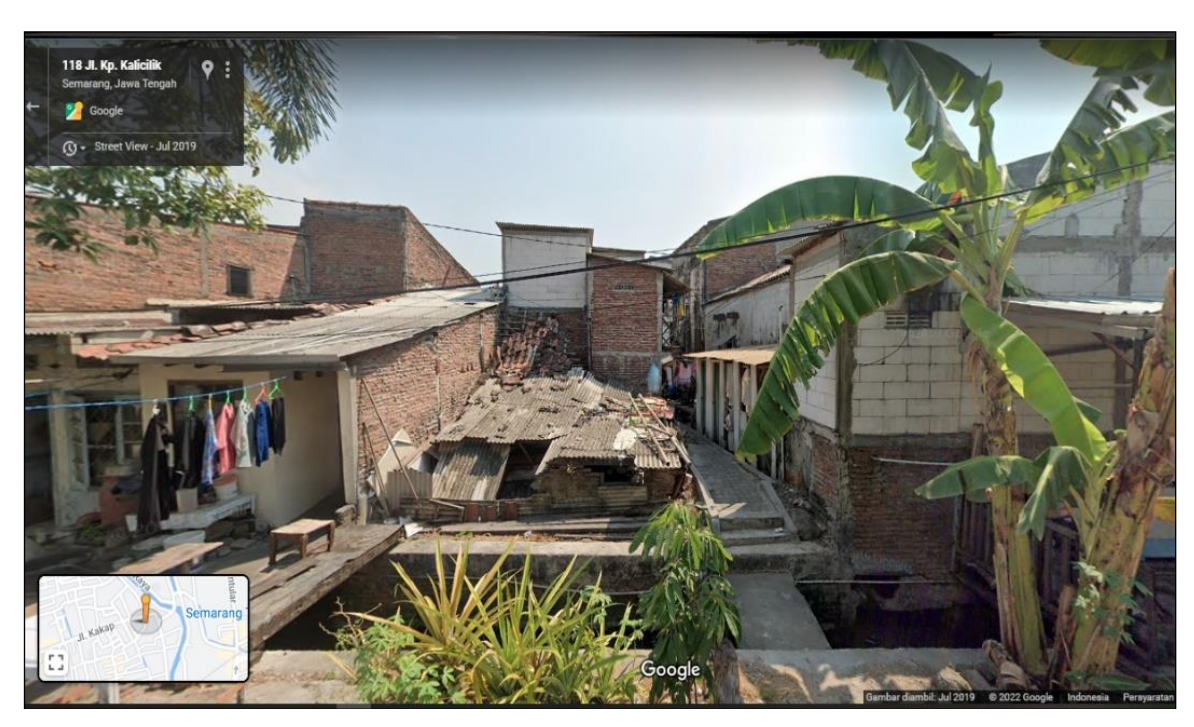
Fig. 8. Kalicilik Village Road from east to west

From 13 building samples located on Jalan Kampung Peranakan, the average indoor temperature (including the living room, family room, bedroom, bathroom, kitchen, and other rooms) ranges from 31.3°C to a maximum of 34.8°C. The average indoor temperature of all samples is 32.9°C.