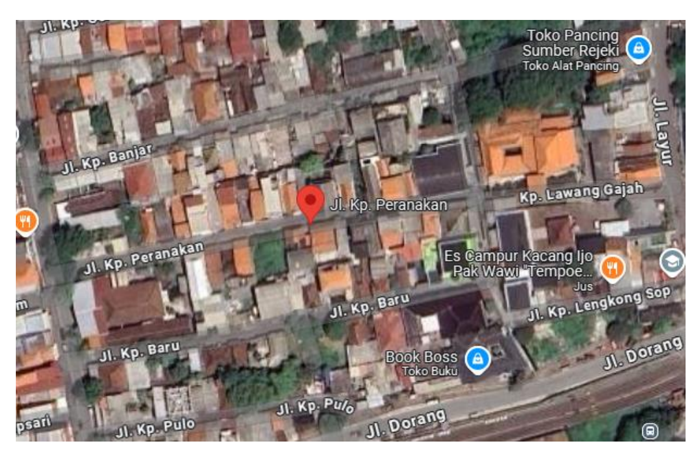
Fig. 2. Street Sketch in Jl. Kampung Peranakan

The physical condition of the buildings along these three roads shows apparent disparities in maintenance. Most of the residential buildings along Jalan Kampung Peranakan are wellmaintained, as evidenced by the well-preserved paint and relatively sturdy structures. However, some homes show damage in certain areas, such as wall cracks or roof deterioration, indicating a lack of adequate maintenance Environmental systems. factors. limited resources, and insufficient access to maintenance services may contribute to the neglect of certain buildings. These differences in condition also reflect the socio-economic dynamics within the community, which influence residents' decisions regarding the upkeep or renovation of their homes.