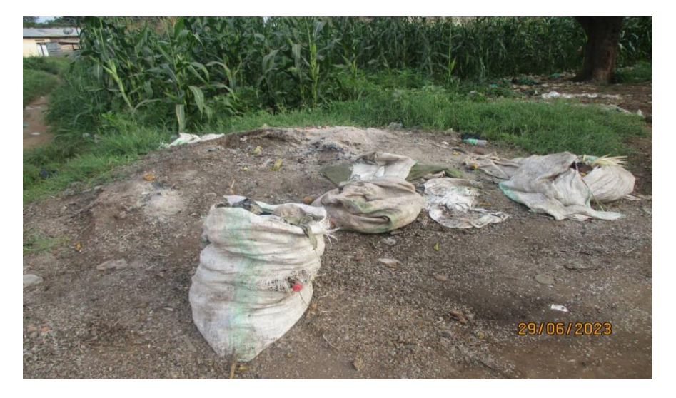
Plate 1. Poorly disposed ashes packed in gunny bags (2023)