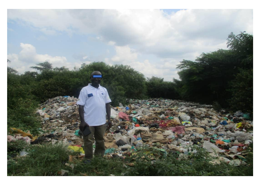
Plate 2. A Heap of wastes dumped on land (2023)

Andama et al.; J. Global Ecol. Environ., vol. 20, no. 4, pp. 155-168, 2024; Article no.JOGEE.12493