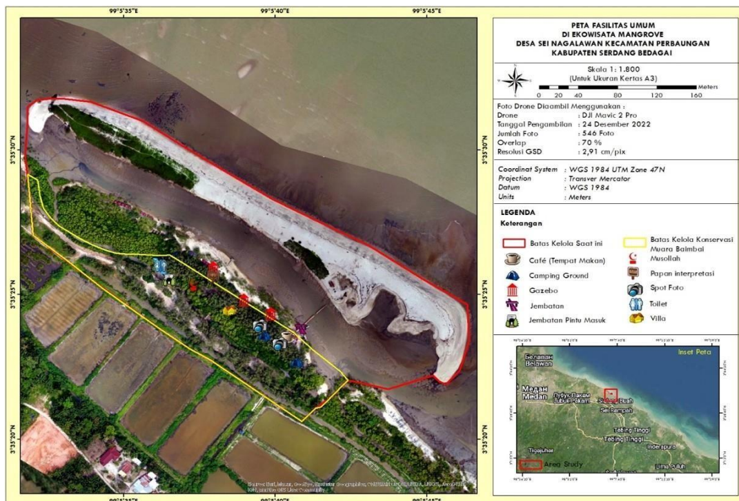
Fig. 2. Boundaries of the permitted area, potential attractions, and ecotourism facilities at Sei Nagalawan Mangrove Beach captured utilizing the DJI Mavic 2 Pro drone

Moreover, the mangrove forest in this location serves not only as a natural attraction but also as an educational object. The mangrove forest has become a learning space for various educational institutions and community groups. The successful rehabilitation of the mangrove forest since 2010 has restored the forest's functions, provided environmental services, and created tourist attractions.