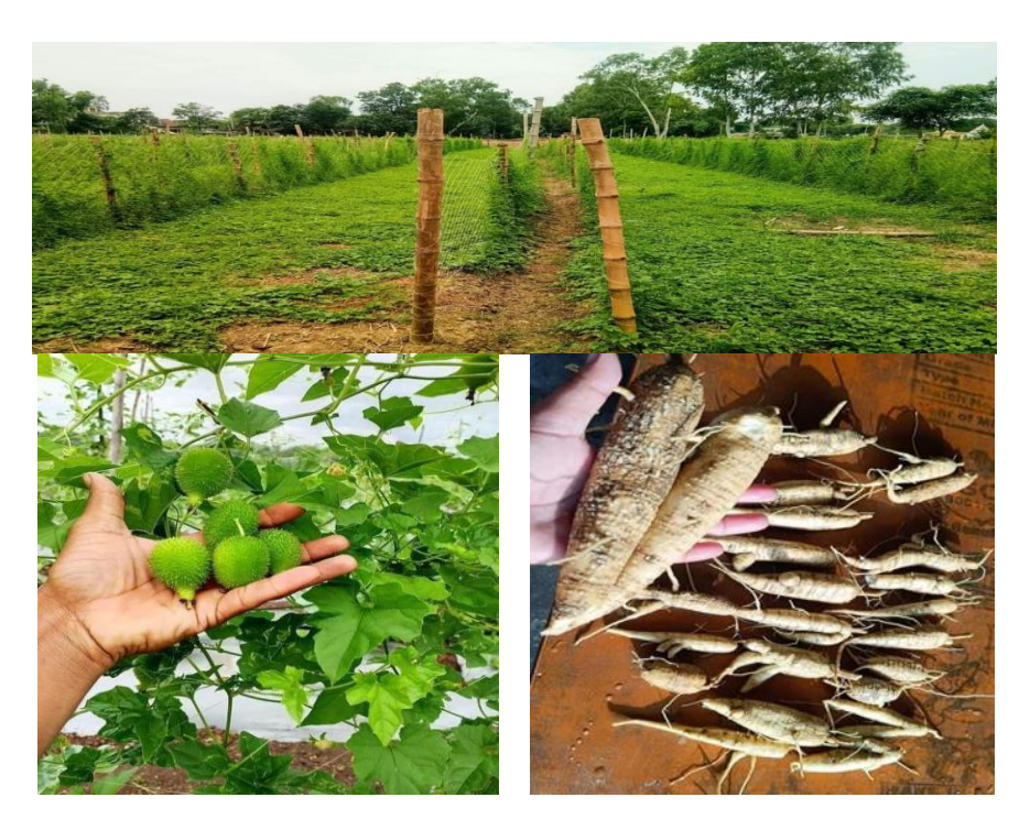
Picture 1. Images showing cultivation field, fruits and roots of spine gourd

Kumar et al.; Int. J. Environ. Clim. Change, vol. 13, no. 11, pp. 2300-2305, 2023; Article no.IJECC.108358