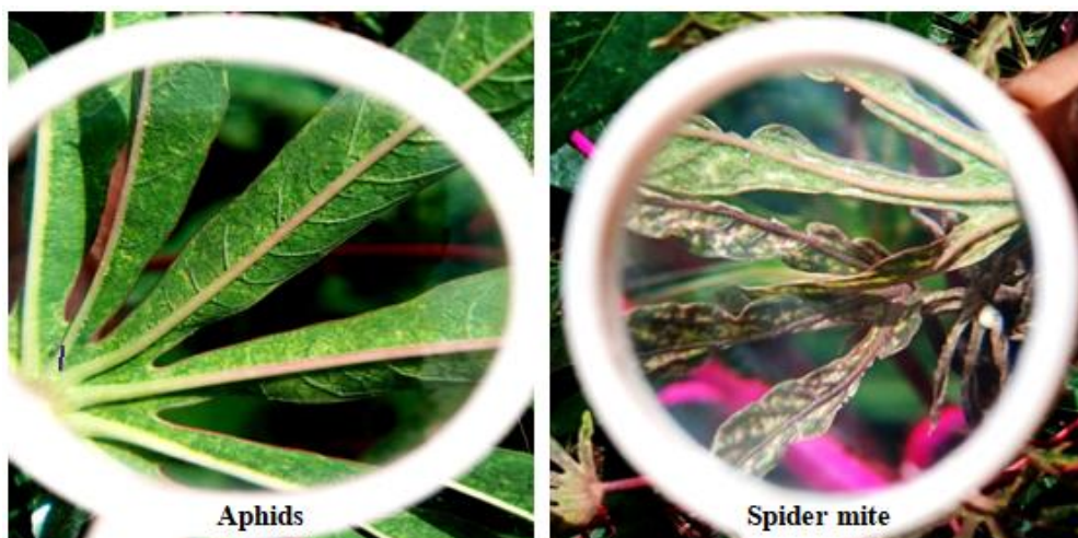
Fig. 1. The major vectors as observed during field screening of elite cassava lines in Solai, Elgeyo Marakwet and University of Eldoret experimental sites

Data on severity of the two diseases (CMD and CBSD) were analyzed using Genstat statistical software version 16.0 VSN International Ltd. The mean differences between the cassava lines, experimental sites and the interactions between these two factors was tested using Tukey's test. Additionally, meta analysis (GGE Biplot) was performed on the severity data to determine the adaptability and suitability of different cassava lines to screening sites and the results were presented in terms of scatter plots, ranking and comparison biplot correlation matrices with first principal component (PC1) and second principal component (PC2).