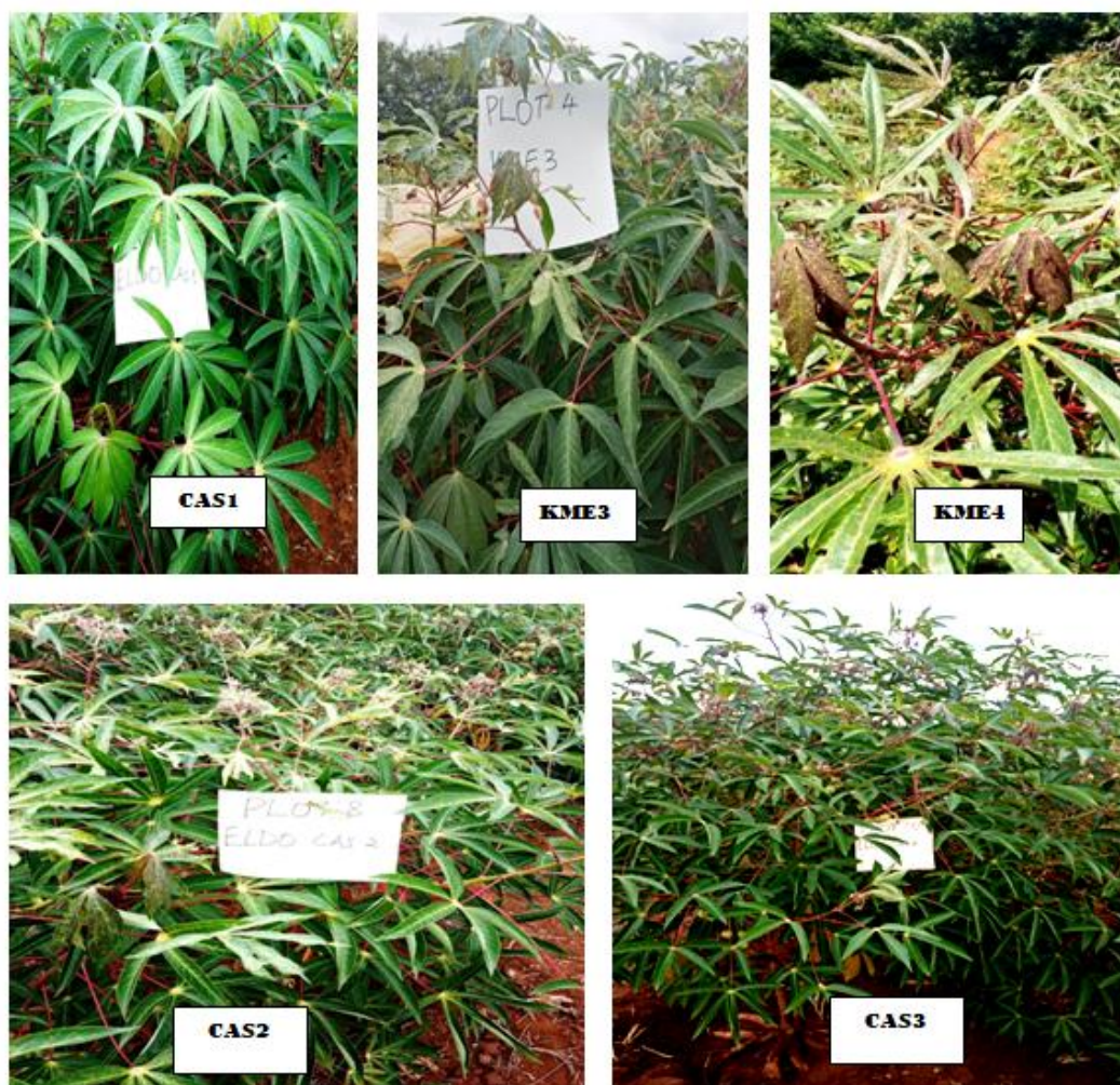
Fig. 3. Response of elite cassava line (CAS1 – CAS3) and Parental lines (KME3 and KME4) to brown streak virus disease under field conditions (Solai site)