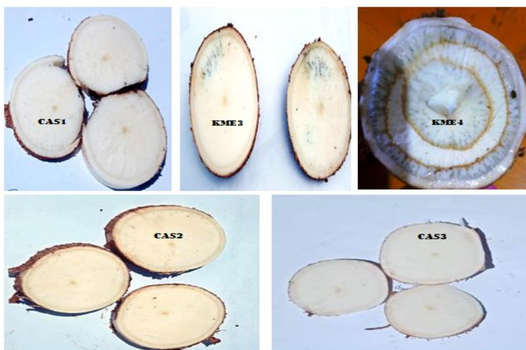
Fig. 4. Expression of root infection by elite cassava line (CAS1 – CAS3) and parental lines (KME3 and KME4) to brown streak virus disease under field conditions. Elite lines were resistant compared to parental lines

The ranking biplot correlation matrix for cassava genotypes (Fig. 6c) revealed that all the elite cassava lines expressed almost similar response to CBSD under field condition at Chepkoilel site. However, Solai and Marakwet sites experienced dissimilar responses to CBSD by all the elite cassava lines including parental lines. Just like the response to CMD under field condition, the comparison biplot (Fig. 6d) identified KME3 as the most ideal genotype across all the three environmental conditions and it was also the most susceptible genotype to CBSD followed by KME4 based on symptom expression on leaves. The remaining elite lines (CAS 1, CAS 2 and CAS 3) were tolerant to the disease and expressed low foliar severity.