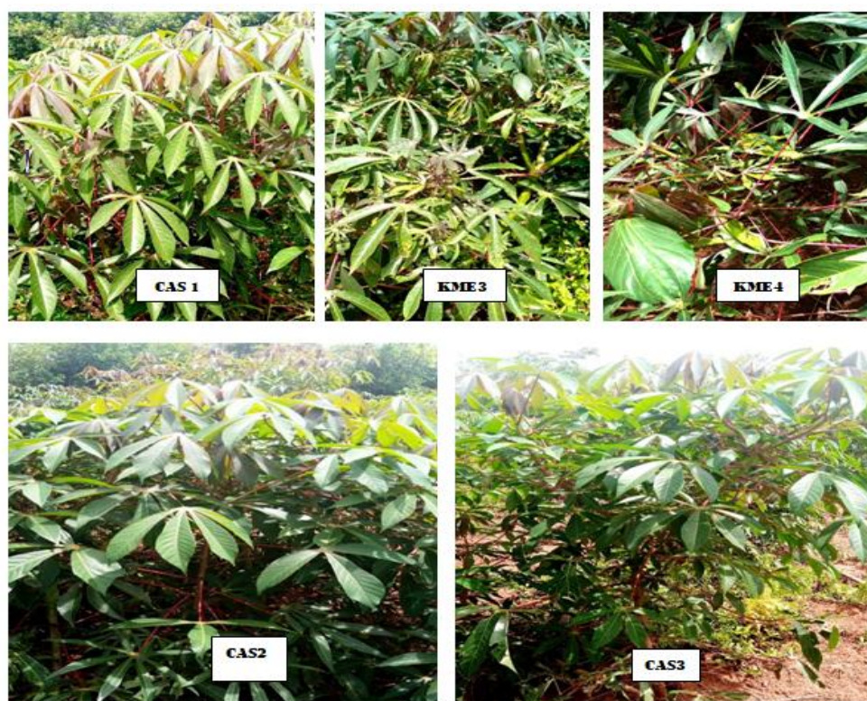
Fig. 2. Response of elite cassava lines (CAS1 – CAS3) and Parental lines (KME3 and KME4) to mosaic virus disease under field conditions (Solai site)